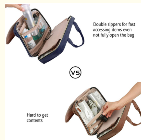
Hard to get contents