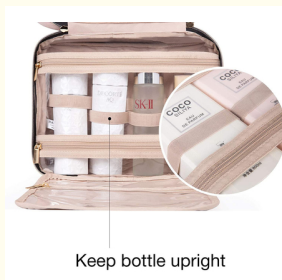
Keep bottle upright