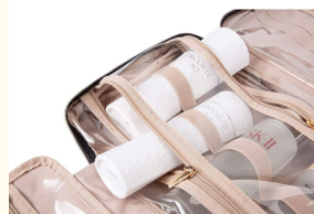
Double zipper for fast accessing items