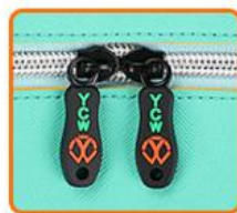
RUBBER ZIPPER PULLER