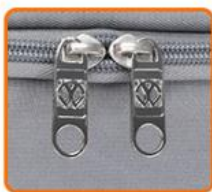
METAL DEBOSSED ZIPPER PULLER