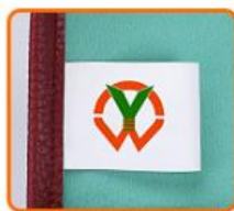
WASHING CARE LABEL